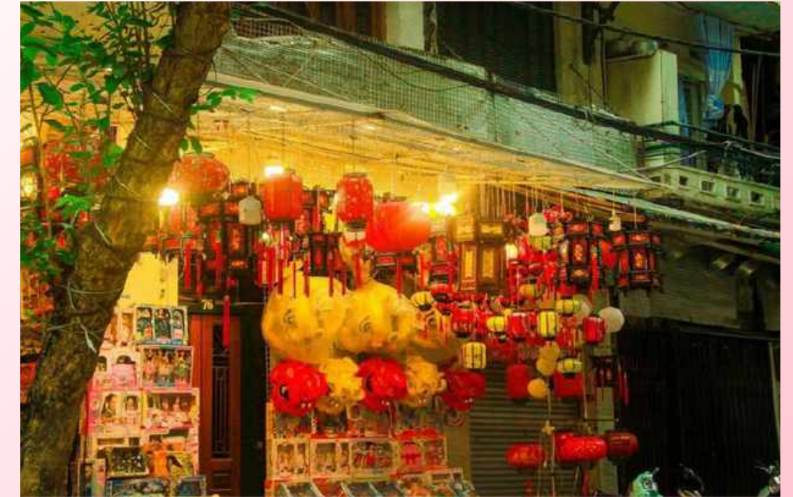
#The old quarters